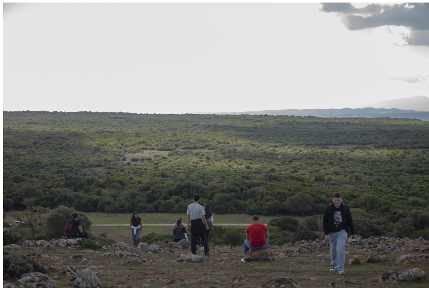
Fig 2. Giara landscape with its characteristic maquis and cork oak forest

Inland from Alghero, North-West Sardinia, the Park boasts 60 kilometres of coastline with sandy beaches alternating with sheer cliffs, bays, sea caves and lagoons, surrounded by Punta Giglio, Punta Cristallo and Mount Doglia. Here, deer, horses and white donkeys roam among dense Mediterranean scrub consisting of strawberry trees, helichrysum and broom, as well as endemic species such as the dwarf palm. “Capo Caccia and Isola Piana Marine Protected Area” was established after the Park to protect the area's seascape. It is home to fossil-rich limestone and rare plants clinging to coastal cliffs (Fig. 3). The extremely rare griffon vulture nests on the most inaccessible cliffs, while peregrine falcons, buzzards, barn owls, and common ravens fly around Punta Giglio.