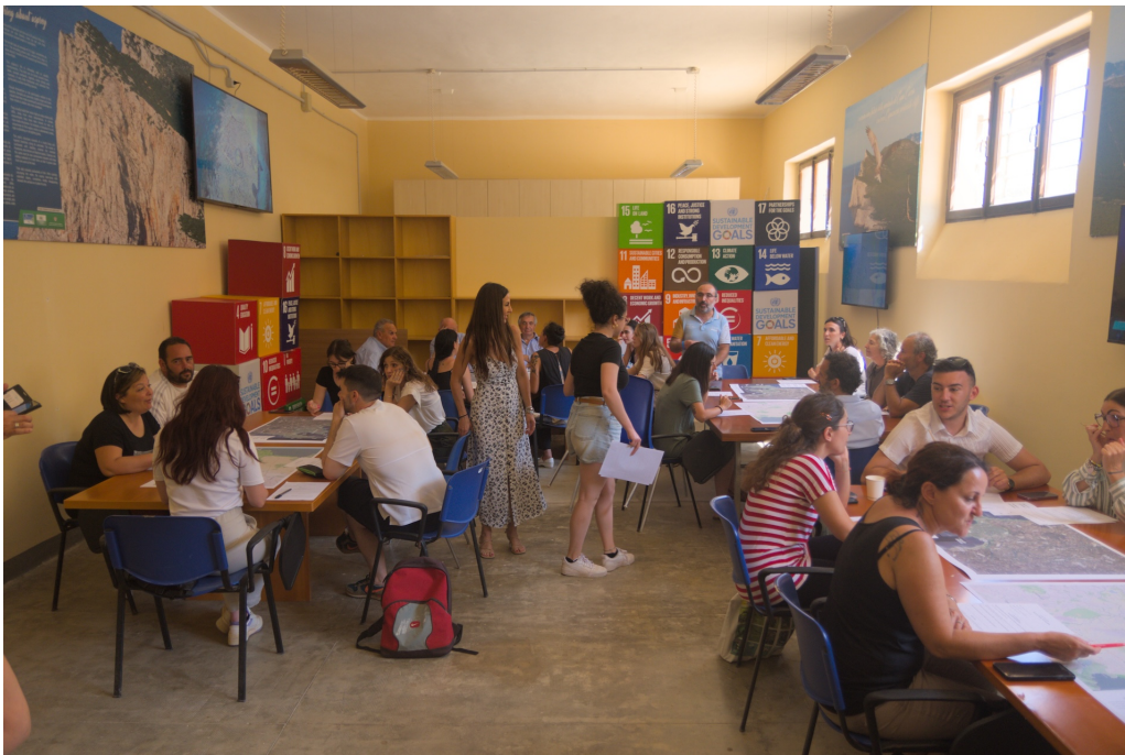
Fig 5. Participatory tables with Sardinian people and stakeholders at Porto Conte

Third, the experience from the fieldtrips has stimulated deeper consideration of the community on their landscapes and man-environment relations, developing a biocultural sense of their environment. This has been reflected in the last type of inside activities, where the community has worked with the experts in collective roundtables or personal interviews to describe their favourite landscapes, employing storytelling, placetelling and collective mapping (Fig. 5). Interactive maps on the table, and boards on the wall with specific questions, served for relationship building and shared reflection on landscape values.