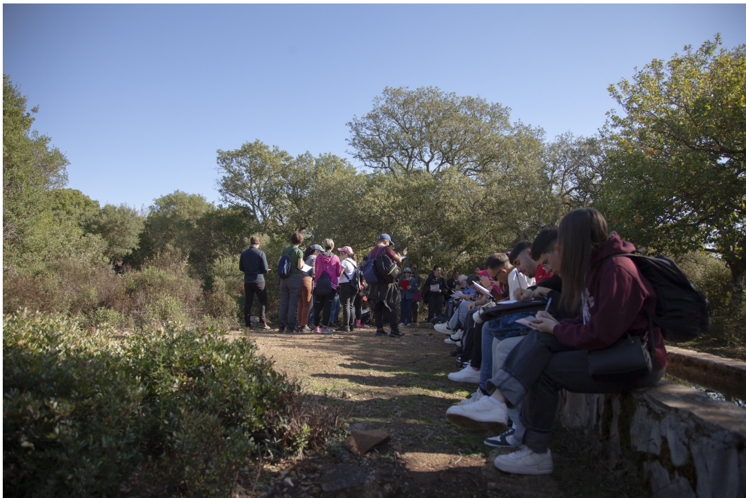
Fig 4. Field trip in the cork oaks of the Giara Plateau

First, at each conference of both conventions, in Genoni and Porto Conte respectively, international scholars have illustrated advanced studies on biocultural landscapes and seascapes in different islands, while local experts have highlighted the biocultural dimension of their islandscapes. Interactive lectures have been employed during the gathering, linking speakers with the audience.